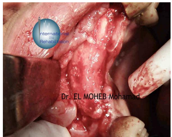
6 months later