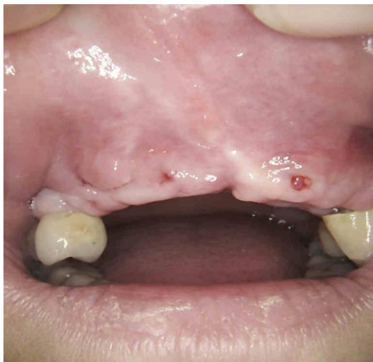
6 months later