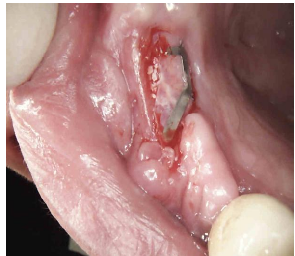
Membrane exposure, yet no implication (2 months after exposure)