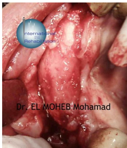
6 months later